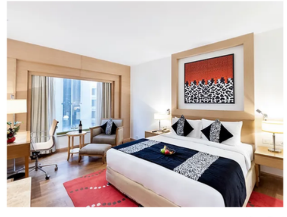
King Bed City View Living & Dining Area Walk-In Wardrobe & Dressing Area Bath & Walk-in Rain Shower Kitchen with Select High-end Gaggenau Appliances Dish Washer