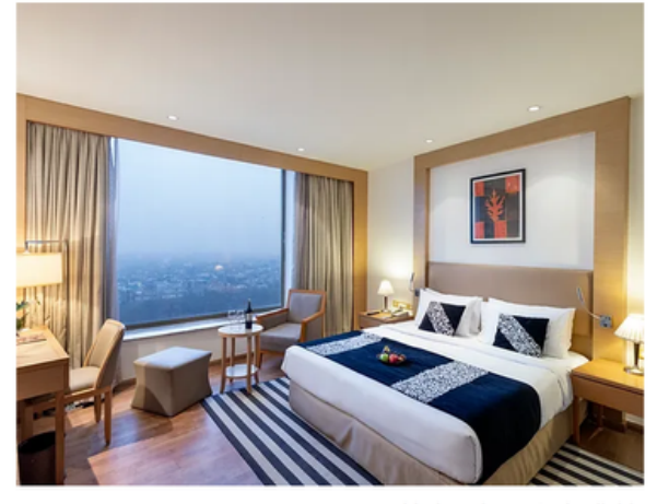
Various Layouts Available City View Living & Dining Area Connecting Rooms Available Walk-In Wardrobe & Dressing Area Bath & Walk-in Rain Shower Kitchen with Select High-end Gaggenau Appliances Dish Washer